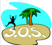
Self Help Advice